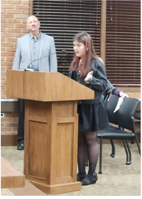
Way to go, one and all!